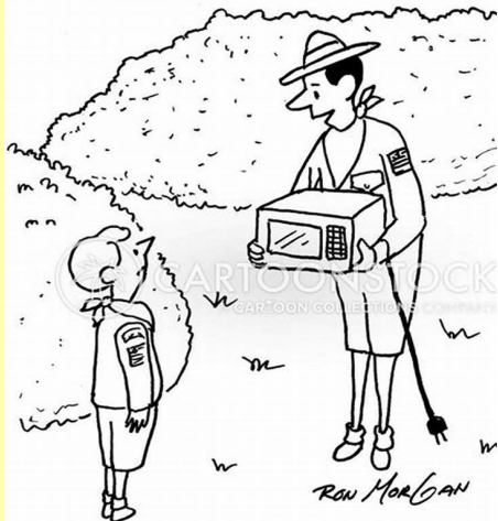
"It's true you always need to be prepared but you're not going to need this microwave."

Kitchen supplies and food prep tools are brought by the Pack.